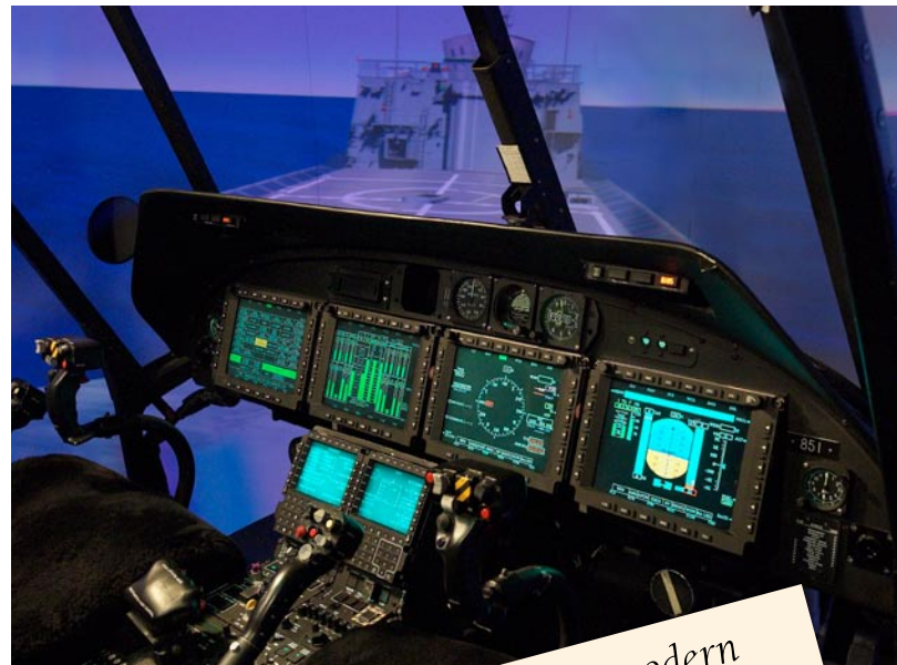
Full Motion Flight Simulator

The SH-2G Super Seasprite: a modern maritime solution for today's multi-mission naval requirements.