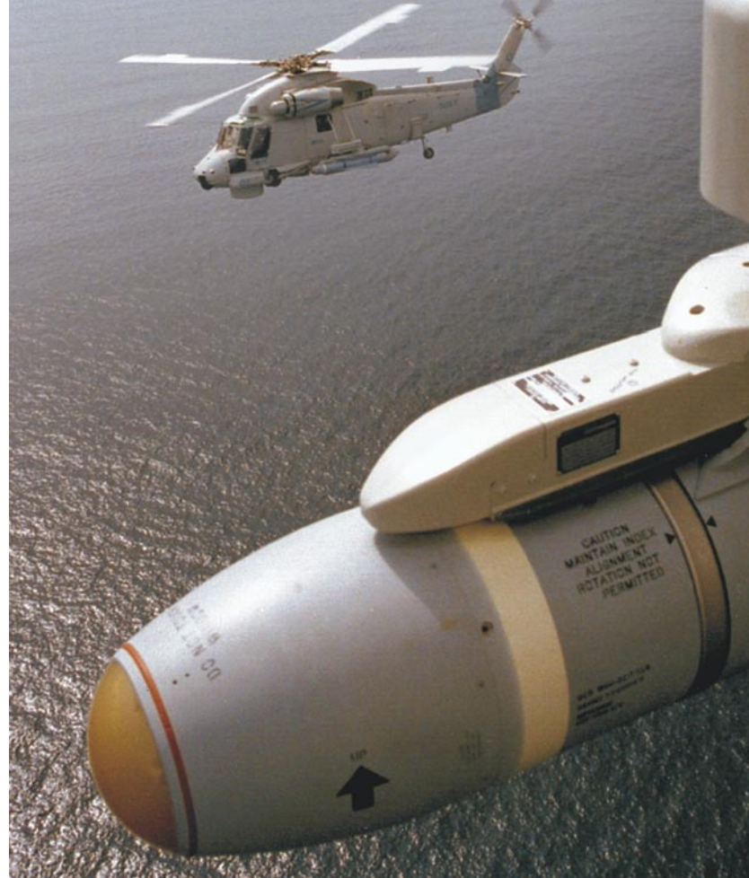
This Royal New Zealand SH-2G can carry an array of weaponry, including Maverick missiles, shown above.