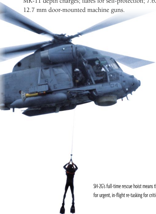
SH-2G's full-time rescue hoist means the helicopter is always ready for urgent, in-flight re-tasking for critical SAR operations.

The SH-2G can carry two MK-46 torpedoes; two AGM-119 Penguin or two AGM-65 Maverick air-to-surface missiles; two MK-11 depth charges; flares for self-protection; 7.62 mm or 12.7 mm door-mounted machine guns.