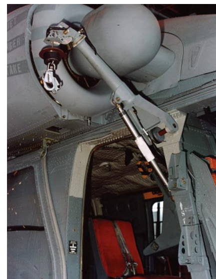
Full-time, 600 lb capacity, rescue hoist.

Because of the ease with which pilots fly the SH-2G, it is an ideal helicopter for visit, board, and search and seizure operations.